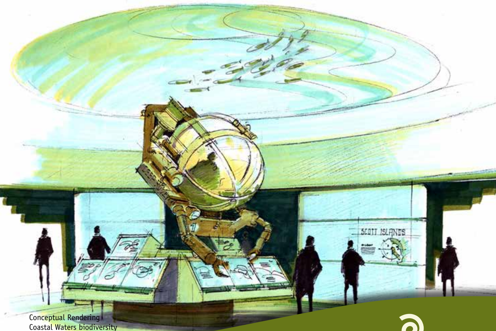
Conceptual Rendering Coastal Waters biodiversity